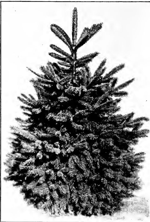
BLACK HILLS SPRUCE

For Windbreak planting we have a cheaper grade, all good trees, but not perfect in shape.